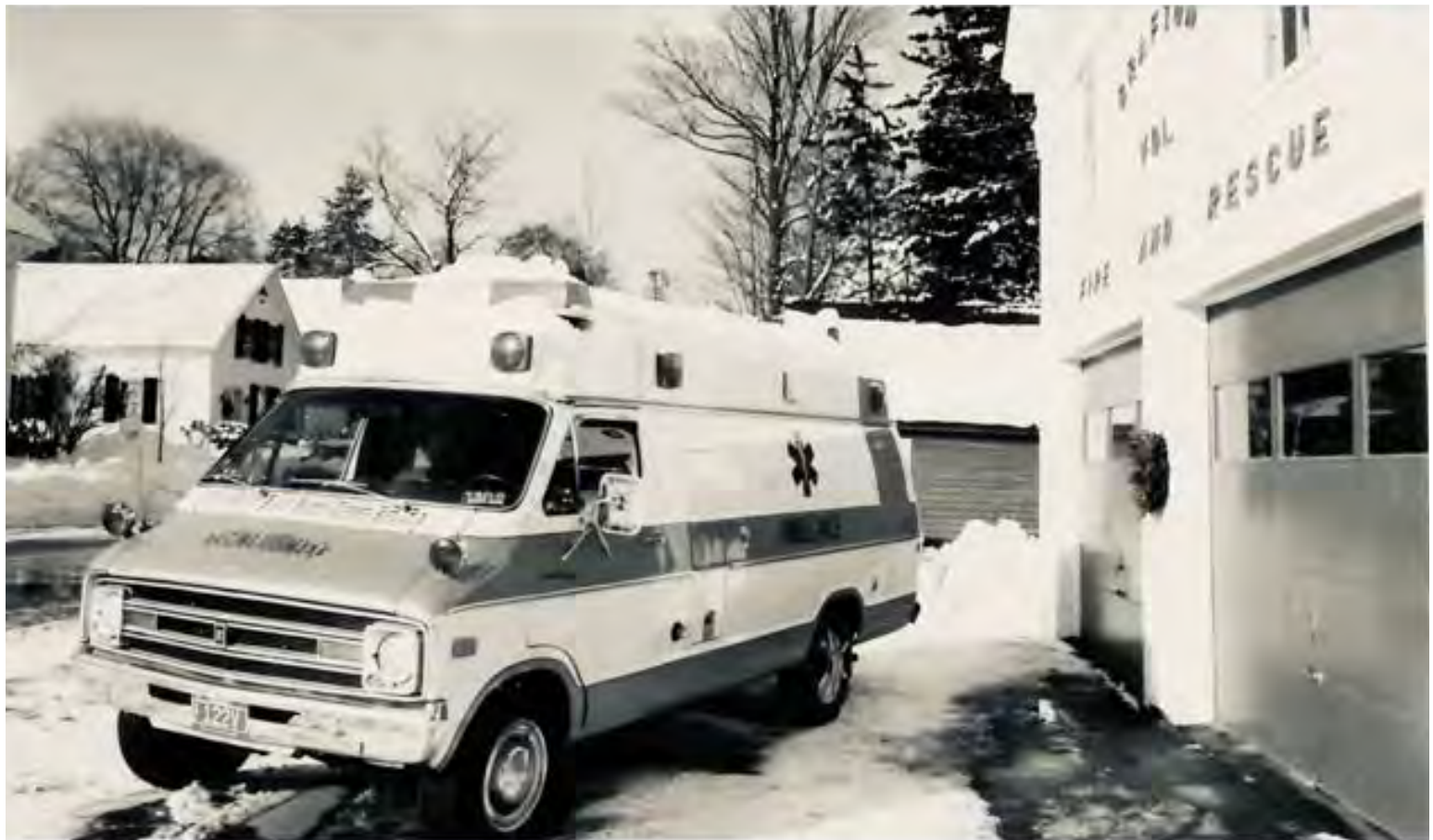
1986: 1978 Dodge Ambulance donated by the Cranford, NJ First Aid Squad becomes 58 Rescue One